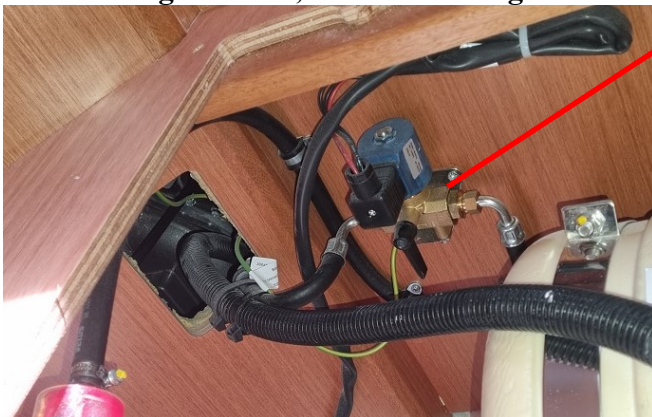
Emergency fuel shut-off (Stbd aft cabin under bunk)

When filling the tank, turn off the engine and do not smoke