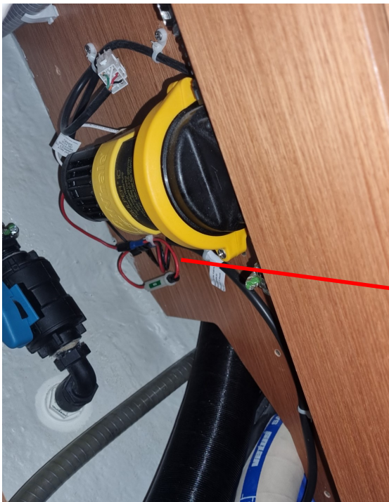
Shower dry pumps with fuse located behind the door under the sink in heads.